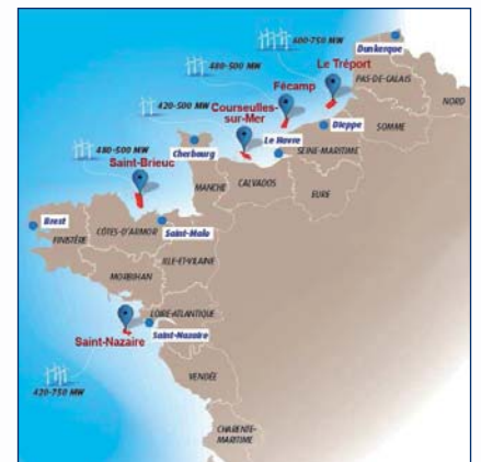
Illustration 1: French offshore development areas within the first round of call for tenders and harbours for the offshore wind energy